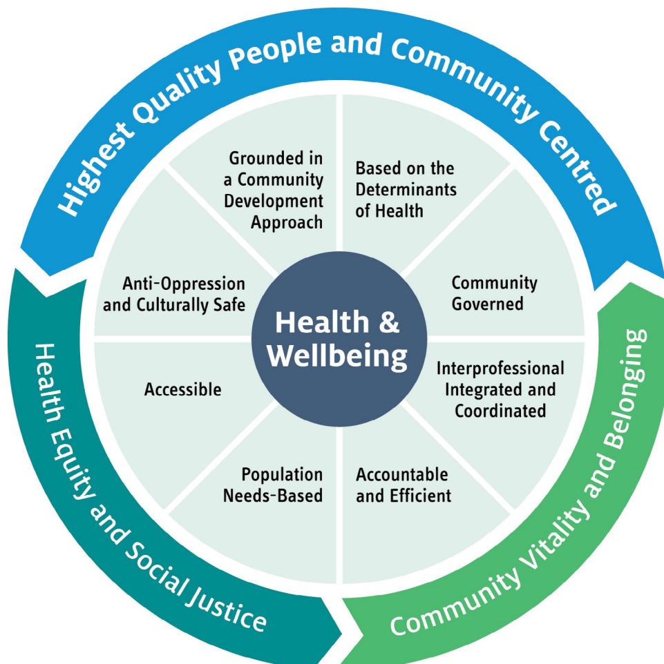
Model of Health and Wellbeing

Our member centres work hand in hand with those they serve. Each is governed by a board of directors made up of clients, community members, health providers and community leaders. Community governance enables health services to be more easily oriented towards what community members identify as their most important needs.