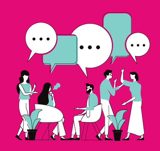
95 provincial associations updated and engaged with new human servicesfocused group to connect the dots on intersecting policy issues for collective advocacy.